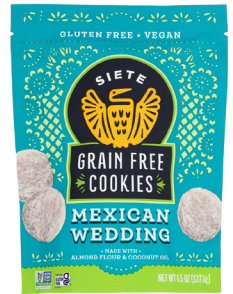
Siete Grain Free Cookies selected varieties